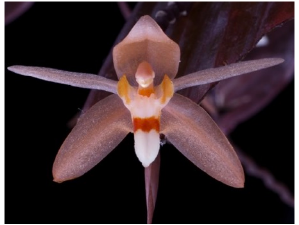
Coelogyne monilirachis 'Gayle'