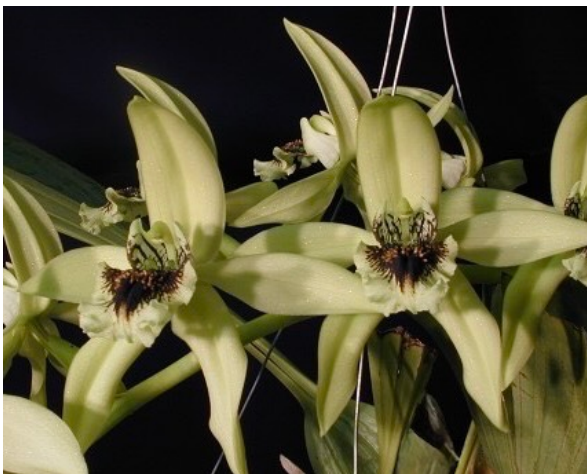
Coelogyne -species (like pandurata ) Andy's Orchids