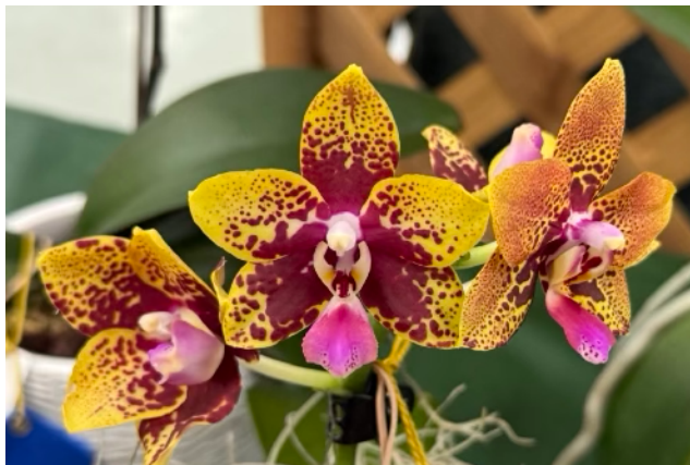
Phal. Zheng Min Anaconda