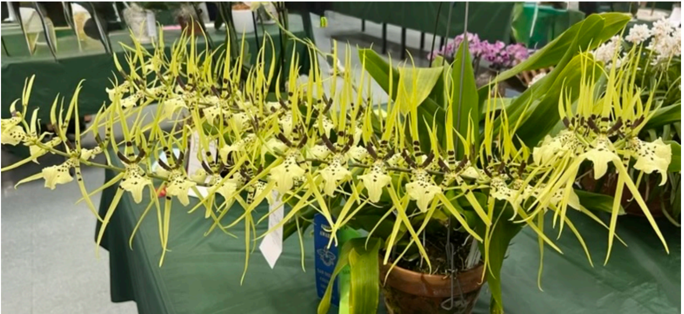
Brassia Rex 'Sakata' AM/AOS

Volunteers are needed for 8-9 set up/plant drop off with 9-1, and 1-5 for volunteers. We will need volunteers to assist in set up (first day), cashiers, help with sales and growing information during our fundraiser and shut down at the end.