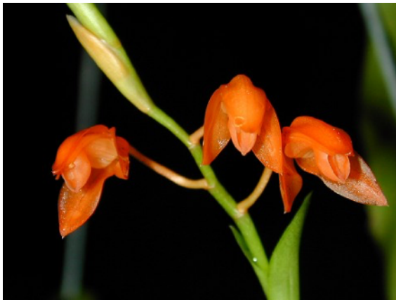
Coelogyne miniata , Andy's Orchids