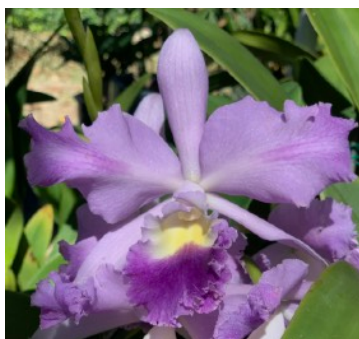
Lc. San Diego Blues 'AMN'

( Lc. Hawaiian Blue Sky X C. DiPozzi Tiziano )