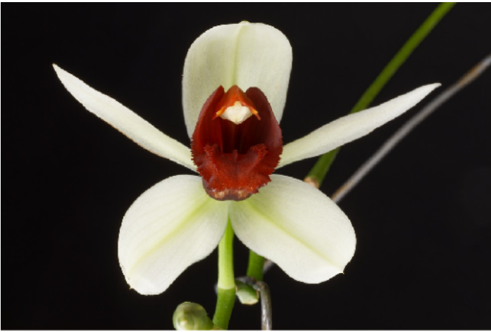
Coelogyne usitana 'Burning Embers'