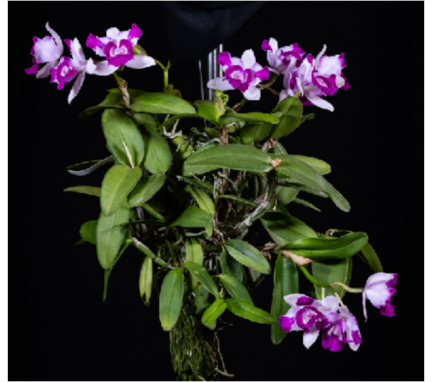
Cattleya intermedia perlorica marginata -'Courtland' AM 83