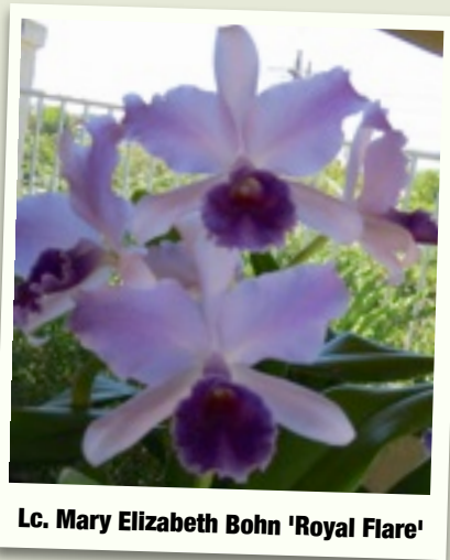
Lc. Mary Elizabeth Bohn 'Royal Flare'