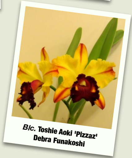
B/c. Toshie Aoki 'Pizzaz' Debra Funakoshi