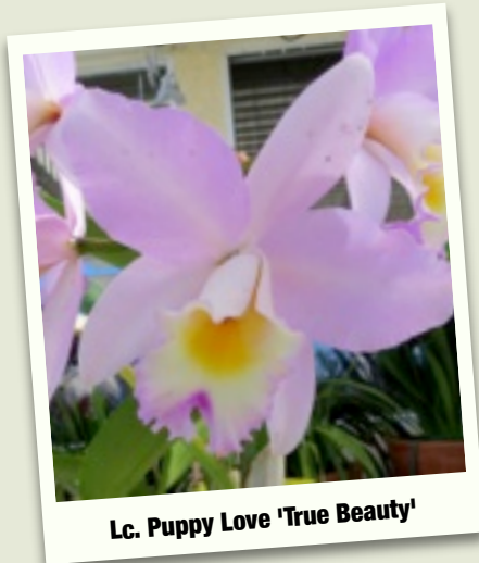
Lc. Puppy Love 'True Beauty'