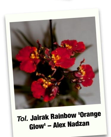
Photos by Helge Weissig - full album at <u>www.palomarorchid.org</u>