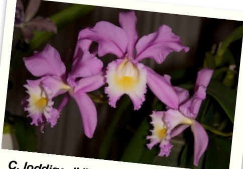
C. loddigesii 'Herbrita' x C. gaskelliana