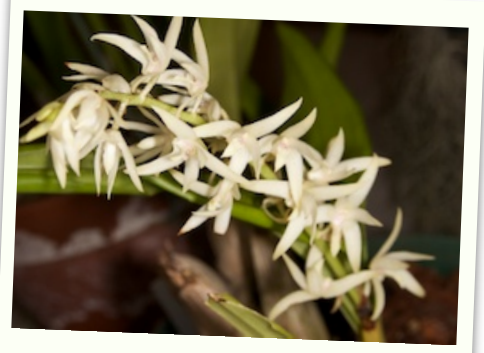
Eria fragrans