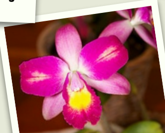
Lc. Tropical Song 'Tango' Alex Nazdan