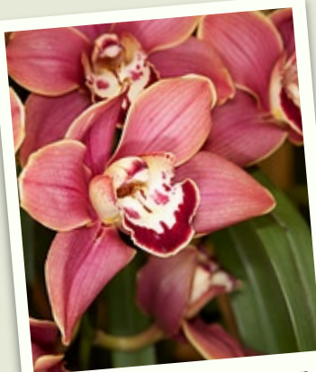
Cym. Dream Girl 'Royal Red' Harry Clyde