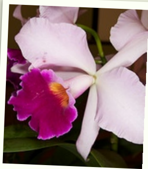
Blc. Beautiful Morning Renate Schmidt