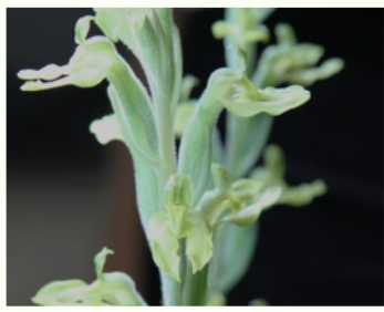
Sarco. sceptrodes 'Loren' AM/AOS Exhibited by Charlie Fouquette Awarded 81 points