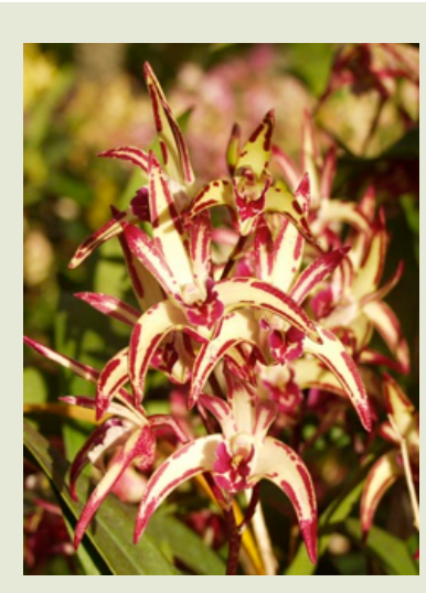
Den. (Aussie Champ X Zip) 'SVO'