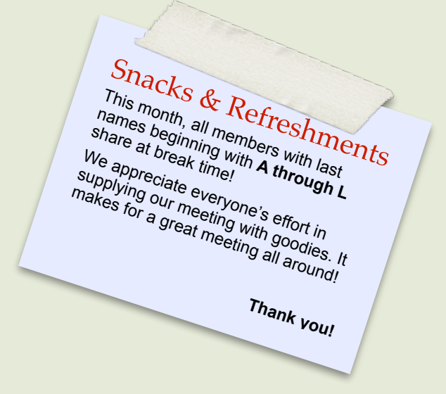
Text and photo by Phyllis S. Prestia Ed.D.