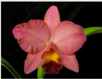
Lc. Tokyo Magic 'Golden Sun' x Slc. Circle of Life 'Mesmerize'