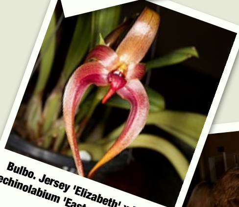
Bulbo. Jersey 'Elizabeth' x Bulbo. echinolabium 'Eastern Star' - Merle Robboy