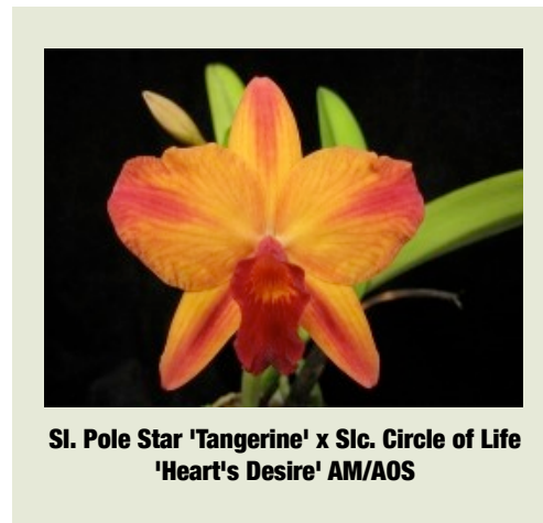
Sl. Pole Star 'Tangerine' x Slc. Circle of Life 'Heart's Desire' AM/AOS