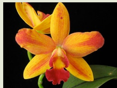
Slc. Newberry Ruby '120511'