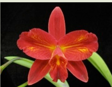
(Slc. Bright Angel x L. briegeri) 'Sunset Flame' x Slc. Angel's Fantasy 'Fiesta Flare'