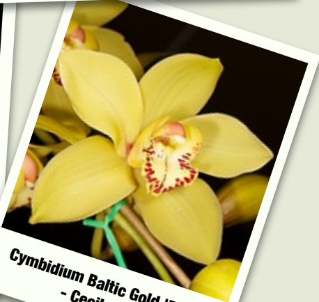
Cymbidium Baltic Gold 'Doug' - Cecily Bird