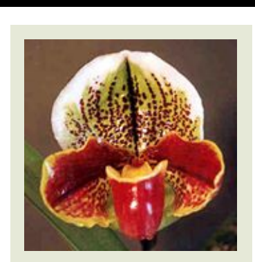
Paph. (Hellas 'Westonbirt' FCC/RHS x Duncan York 'Shouthard' AM/AOS)

edge, love, and enthusiasm for orchids were contagious and when they built a second greenhouse, she decided it would be hers and that was the moment that orchids became an important part of her life.