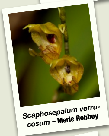
Scaphosepalum verrucosum – Merle Robboy