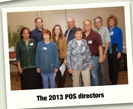
The 2013 POS directors