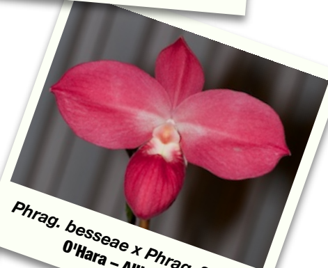
Phrag. besseae x Phrag. Scarlet O'Hara – Allie Tran