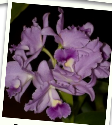
B/c. Volcano Blue 'Datsun' Alex Nadzan