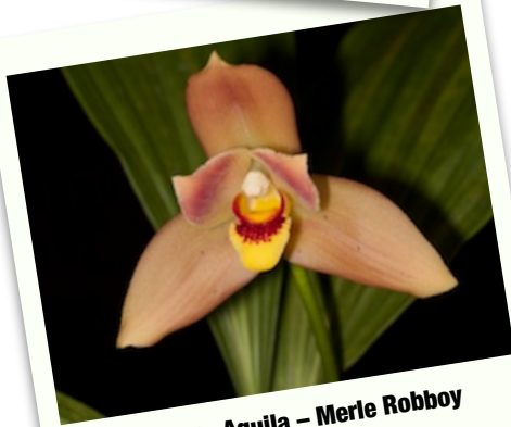
Lycaste Aquila – Merle Robboy