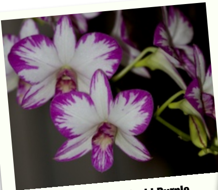
Dendrobium Enobi Purple Anita Spencer