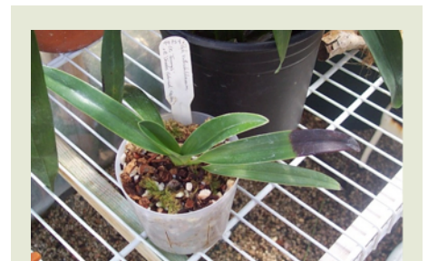
Paphiopedilum with advancing tip rot on leaf. What should you do about it?