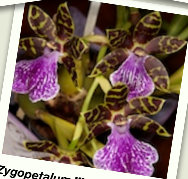
Zygopetalum Kiwi Korker 'Kutie' x Mishima Goddess 'Burgundy' Cecily Bird