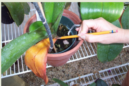
Phalaenopsis with rotting basal leaf. What really causes this?