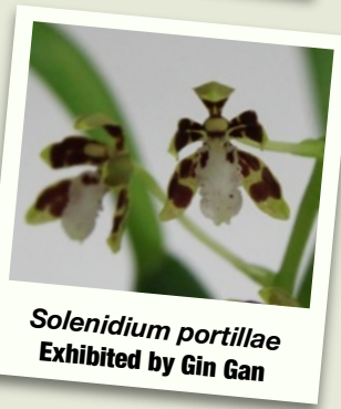
Solenidium portillae Exhibited by Gin Gan