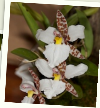
Lemboglossum rossii Iso Zehner