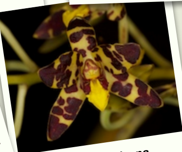
Ansellia africana