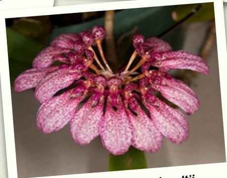
Bulbophyllum eberhardtii Merle Robboy

Photos by Helge Weissig - full album at www.palomarorchid.org