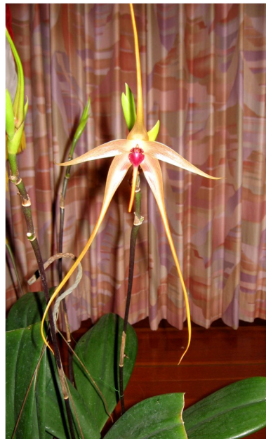
Renate's Bulbophyllum echinolabium 'Jonathan'