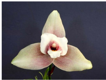
Lycaste Imshootiana ( Lyc. skinneri x Lyc. cruenta )