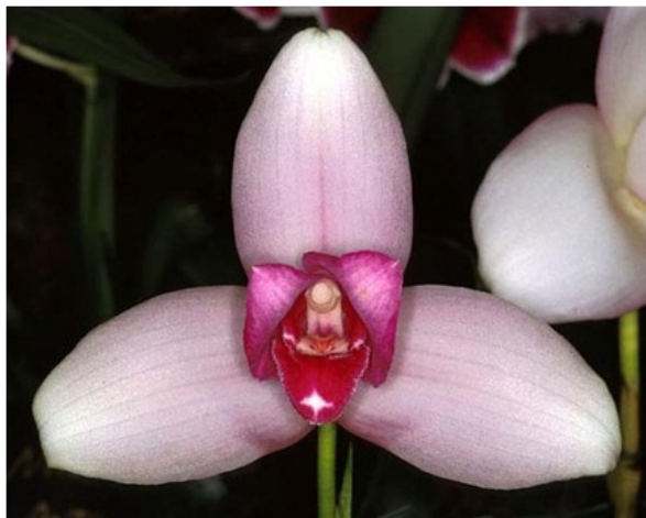
Lycaste skinneri