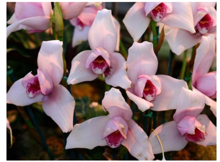
Lycaste skinneri var. ruborosa

Lycaste orchids are one of those orchids that reward us with beautiful blooms, tantalizing fragrances, and also very interesting foliage during the summer. They lose those leaves during their winter rest period when they need a dry cool place to get ready for those spring blooms. When one thinks of Lycaste orchids, we think of the Lycaste aromatica which is a very popular plant here. Members can go to Jim's website ( http://www.calorchid.com/ ) before our meeting to see the assortment of Lycastes that Cal-Orchid is