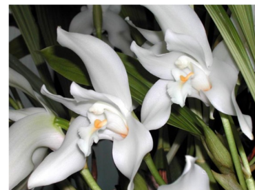
Lycaste Frank Holt ( Lyc skinneri x Lyc. costata)

currently offering for sale. If you see something that you would like to purchase, send him an email and ask him to bring it when he comes here.